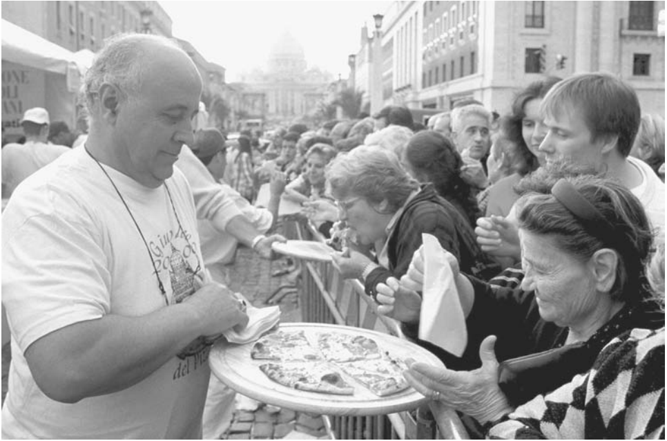
Romans and faithful pilgrims eat free pieces of pizza in Rome's Via della Conciliazione, near St. Peter's Square, as part of the Jubilee of the Pizza Makers.